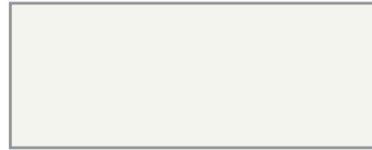
RAL 9016 Traffic White

Our standard colour range is below; warranted against corrosion for two years. Enhanced PPC finishes are available for C3, C4 and C5 applications, and we're happy to finish in non-standard colours too; please contact our Sales Team for further information.