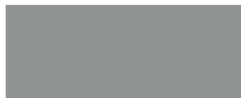
RAL 7042 Traffic Grey A