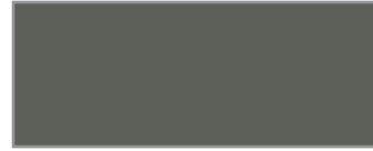
RAL 7009 Green Grey