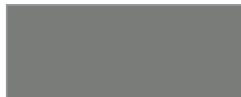
RAL 7037 Dusty Grey