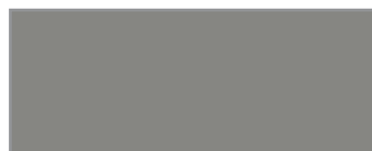
RAL 9007 Grey Aluminium