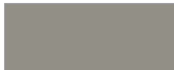
RAL 7030 Stone Grey