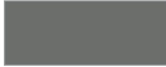
RAL 7005 Mouse Grey