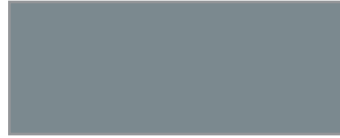
RAL 7000 Squirrel Grey