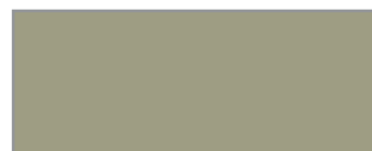
BS12B21 Moorland Green