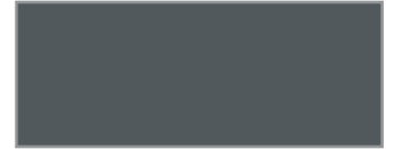
RAL 7011 Iron Grey