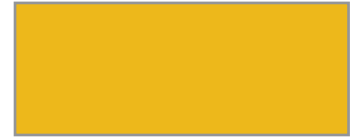
RAL 1021 Rape Yellow